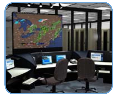
The styling of VisionLine II is suitable for state-of-the-art operations