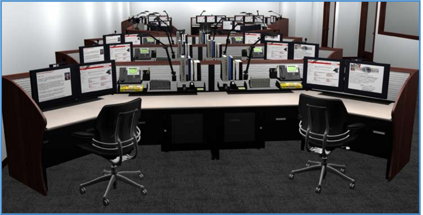
VisionLine II is our best modular wall console platform