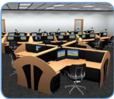
4-position workstation cluster is constructed from shared walls for a space-efficient and cost-effective configuration

This is our best modular wall solution for flat panel technologies based on a highly engineered steel spine that offers excellent cable routing and technology management. The frame construction is ideal for space planning large call-centers, team configurations or for angled runs that require sightlines to room architecture. Select from specialized components such as data/voice inserts, integrated CPU swivel mounts or even hard-wired power distribution to take your VL2 console system to the next level. Attractive laminated door kits, corner connectors and end panels provide the final touch to create an impressive look.