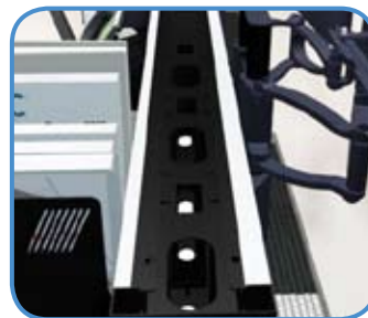
The VL2 frame or spine can be configured for single-sided and shared consoles