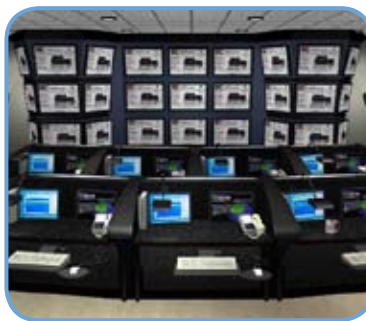
Configured in viewing rows with dedicated space for each operator, VisionLine II provides excellent sightlines to video walls and other room displays