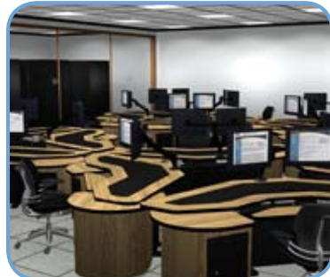
Cluster of three consoles illustrates our customization capabilities and ergonomic upgrades for sit-to-stand surface operation and adjustable flat panel arms