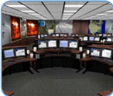
Sweeping console configuration provides a parabolic arrangement of monitor technology with personal environmental controls