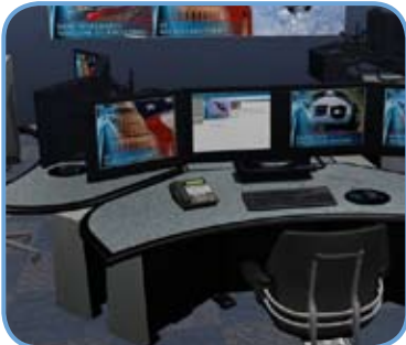
Curved console design features protective urethane edge treatment with sit-to-stand adjustment and our innovative VisionMount flat panel array system

This is our flagship console platform for discriminating customers who require state-of-the-art furniture appearance and functionality. TechVision can be designed for dedicated operator positions or in flowing, shared user configurations. Endless design and component choices enable users, contractors and specifiers to create enclosed or open consoles with flat panel arrays properly configured for excellent focal and viewing distances, curved communal desktop space and integrated personal storage modules. With our proprietary VisionMount™ technology, or motorized lift surfaces, you can upgrade a TechVision console to a sophisticated ergonomic solution that exceeds prevailing ergonomic standards and provides unparalleled operator efficiency and comfort.