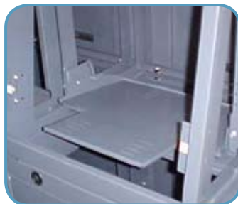
Adjustable monitor shelf in turret unit