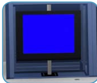
Flat panel display pole mount