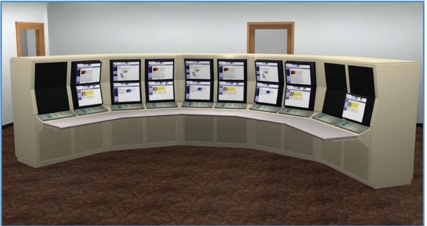
Benchmark is ideal for a variety of specialized applications