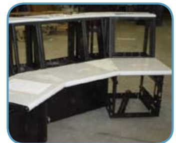
Heavy-duty turret construction provides a rugged console platform and generous technology integration